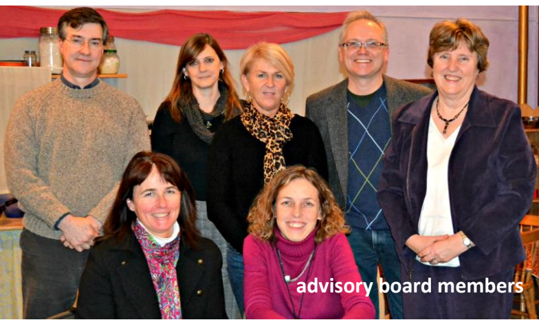
advisory board members

On behalf of the leadership of the school, thank you for both your financial and moral support, along with your deep commitment to the school. The Board members are proud to serve Tamarack Waldorf School, and as the Board looks ahead, we have renewed focus and commitment to ensure the long-term stability and fortitude of the school.