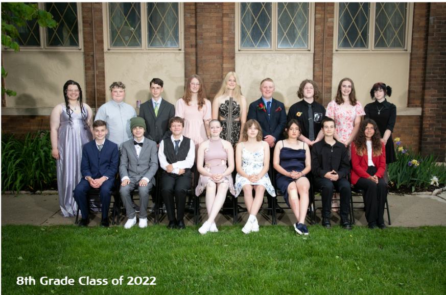
8th Grade Class of 2022

223 students received an immersive and comprehensive Waldorf education