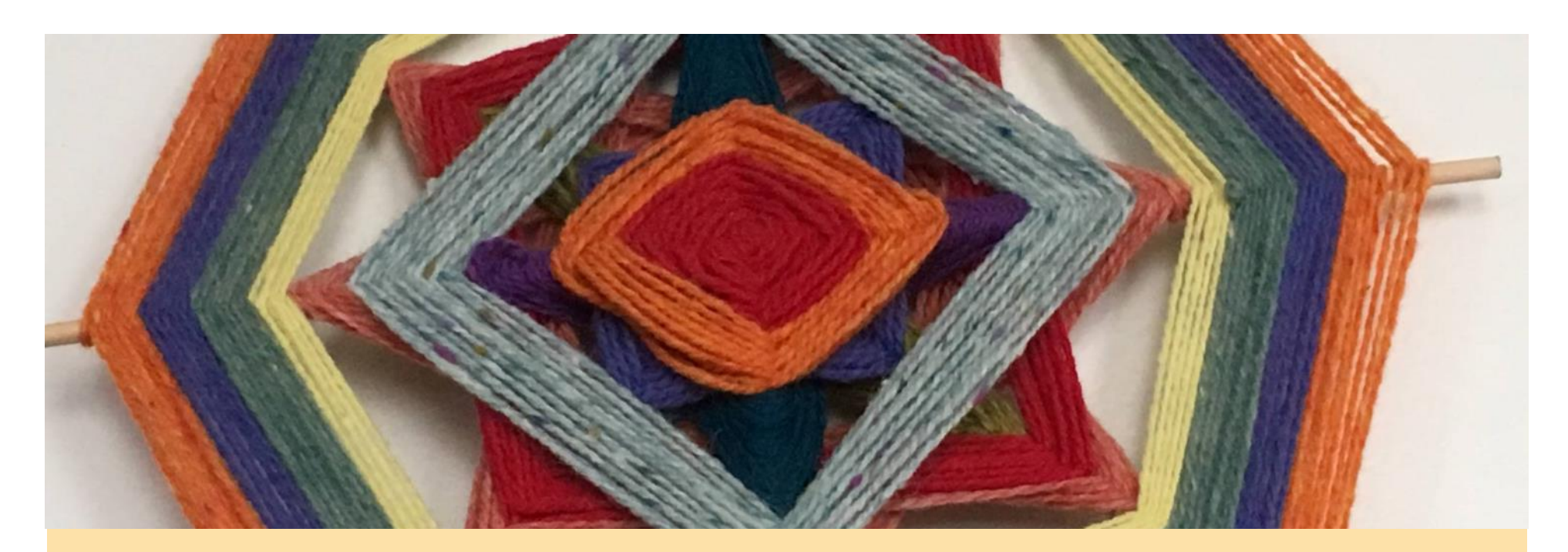
Letter From Our Board President